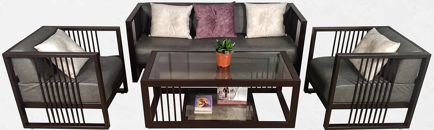
Product Name : BIRCH (Sofa Rexine) Material : METAL Model No. : M0009