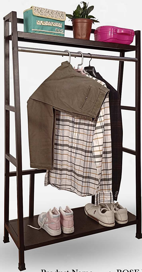
Product Name : ROSE WOOD Material : METAL Model No. : M0020