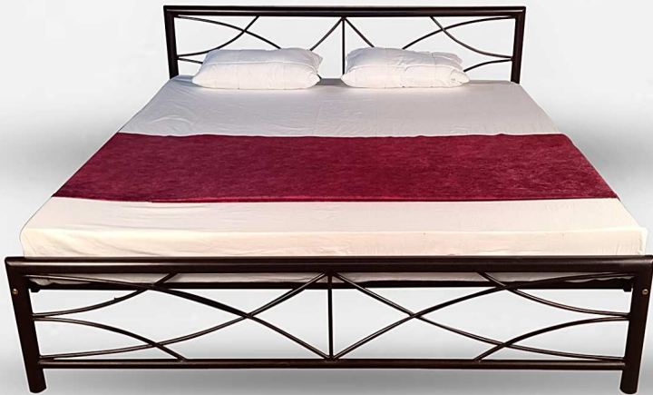
Product Name : POPLAR (Bed) Material : METAL Model No. : M0014