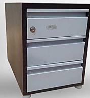
Product Name : HAZEL (Optional) Material : METAL Model No. : M0004