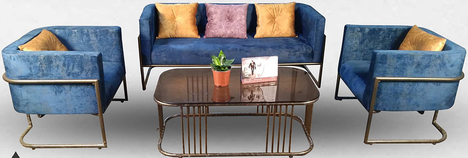
Product Name : CHESTNUT (Sofa) Material : METAL Model No. : M0013