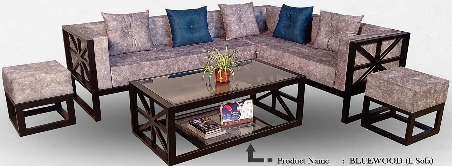
Product Name : BLUEWOOD (L Sofa) Material : METAL Model No. : M0012