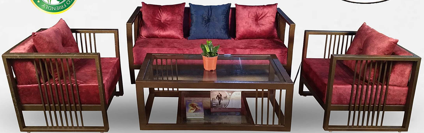
Product Name : CHERRY (Sofa) Material : METAL Model No. : M0008