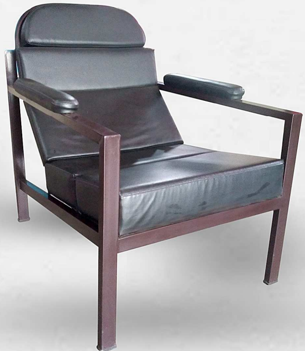
Product Name : PINE (Comfortable Chair) Material : METAL Model No. : M0007