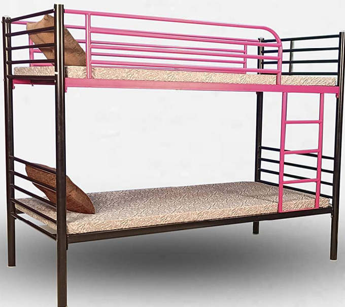
Product Name : OAK (Bunkbed) Material : METAL Model No. : M0018