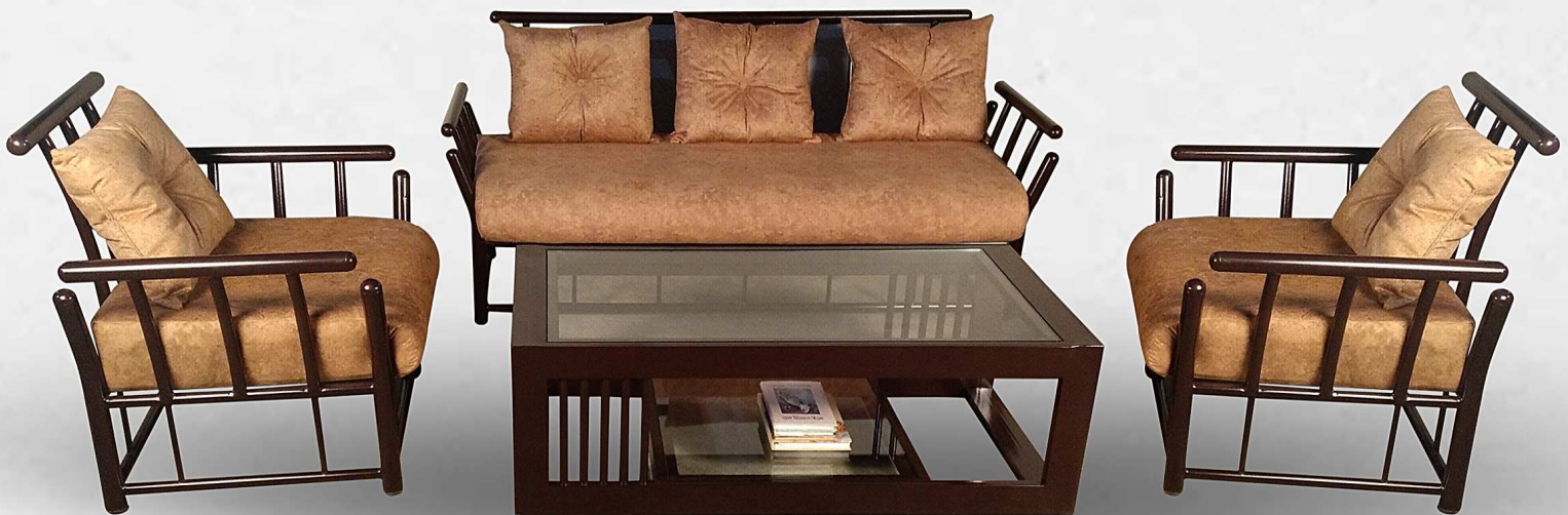
Product Name : SISO (Sofa) Material : METAL Model No. : M0010