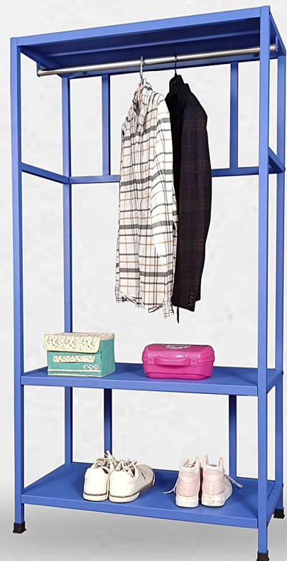
Product Name : DOG WOOD Material : METAL Model No. : M0023