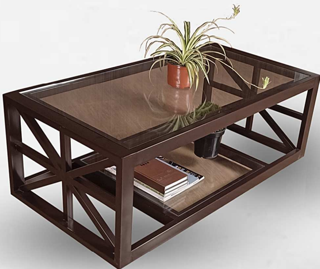
Product Name : WILLOW (Centre Table) Material : METAL Model No. : M0006