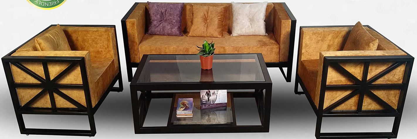
Product Name : HEMLOCK (Sofa) Material : METAL Model No. : M0011