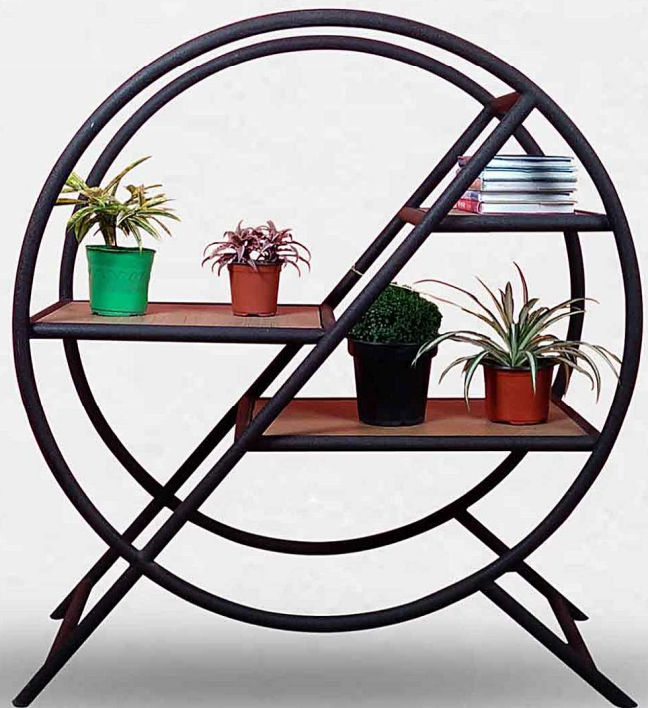
Product Name : MAPLE (Organizer) Material : METAL Model No. : M0027