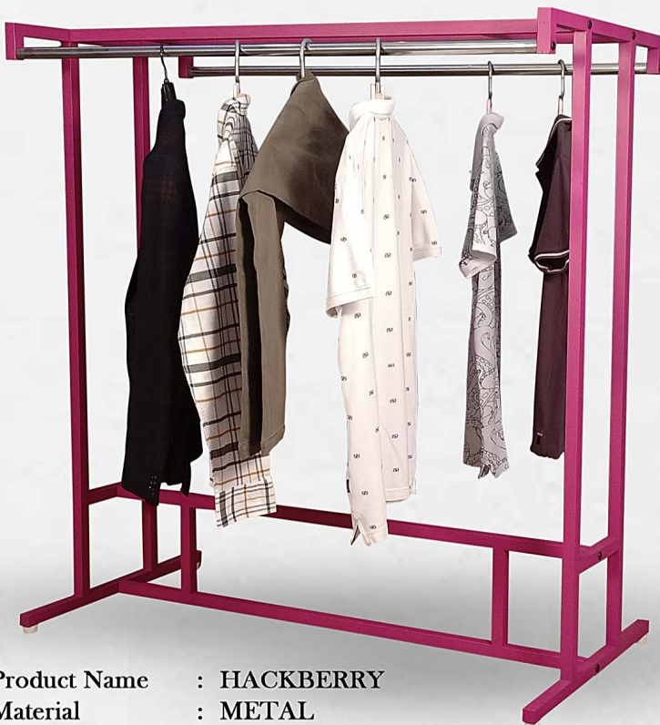
Product Name : HACKBERRY Material : METAL Model No. : M0022