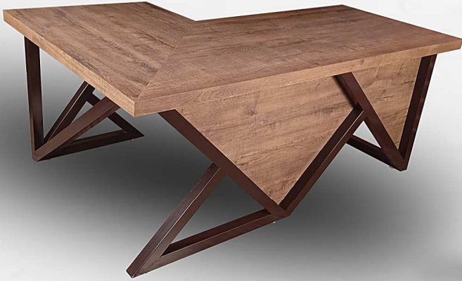
Product Name : EBONY (Office Table) Material : METAL Model No. : M0003