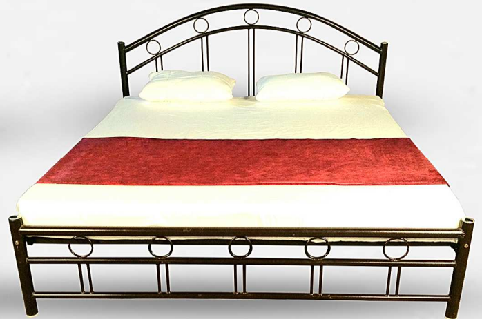
Product Name : PECAN (Bed) Material : METAL Model No. : M0015