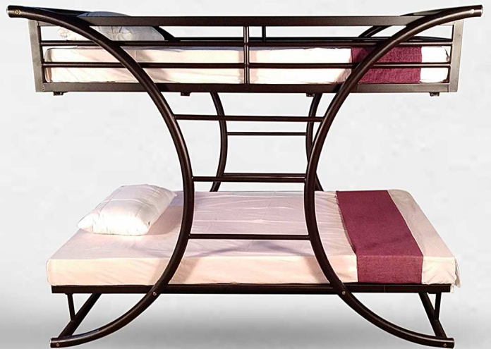
Product Name : WALNUT (Bunkbed) Material : METAL Model No. : M0019