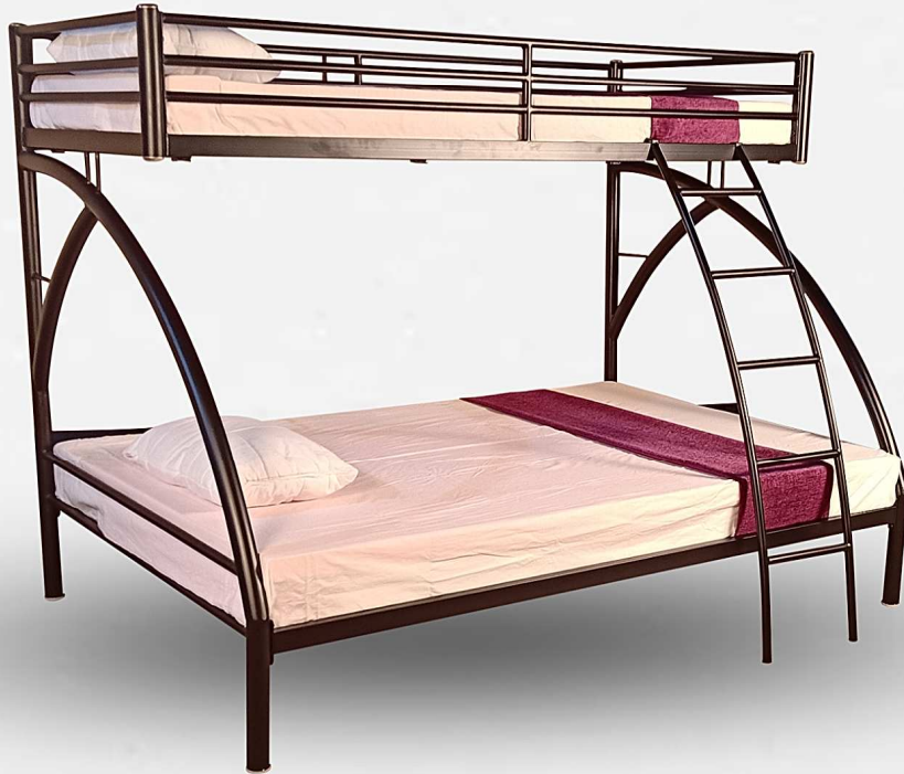
Product Name : TEAK (Bunkbed) Material : METAL Model No. : M0017