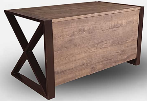
Product Name : EUCALYPTUS (Office Table) Material : METAL Model No. : M0005