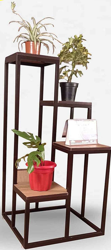
Product Name : LIMBA (Flower Stand) Material : METAL Model No. : M0024