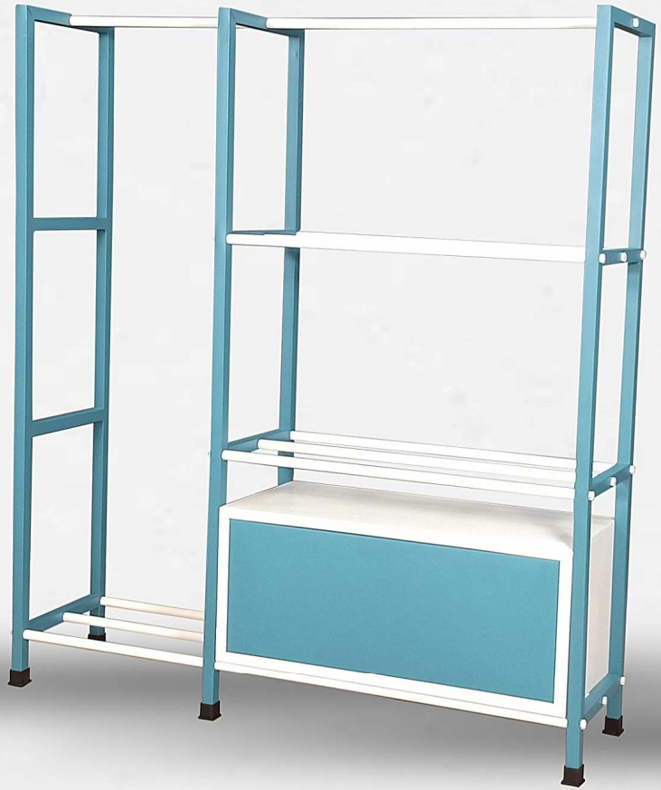
Product Name : NUTMEG Material : METAL Model No. : M0021