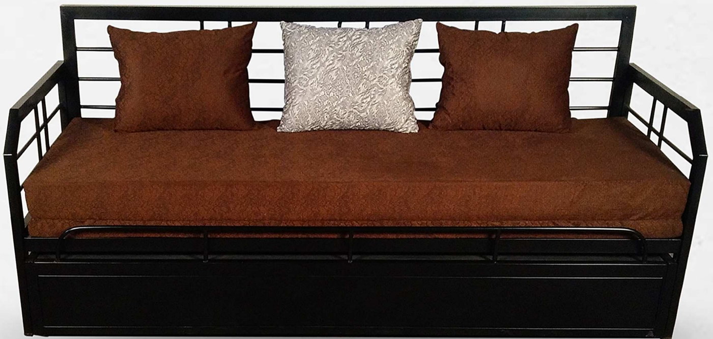
Product Name : LOCUST (Sofa Cum Bed) Material : METAL Model No. : M0016